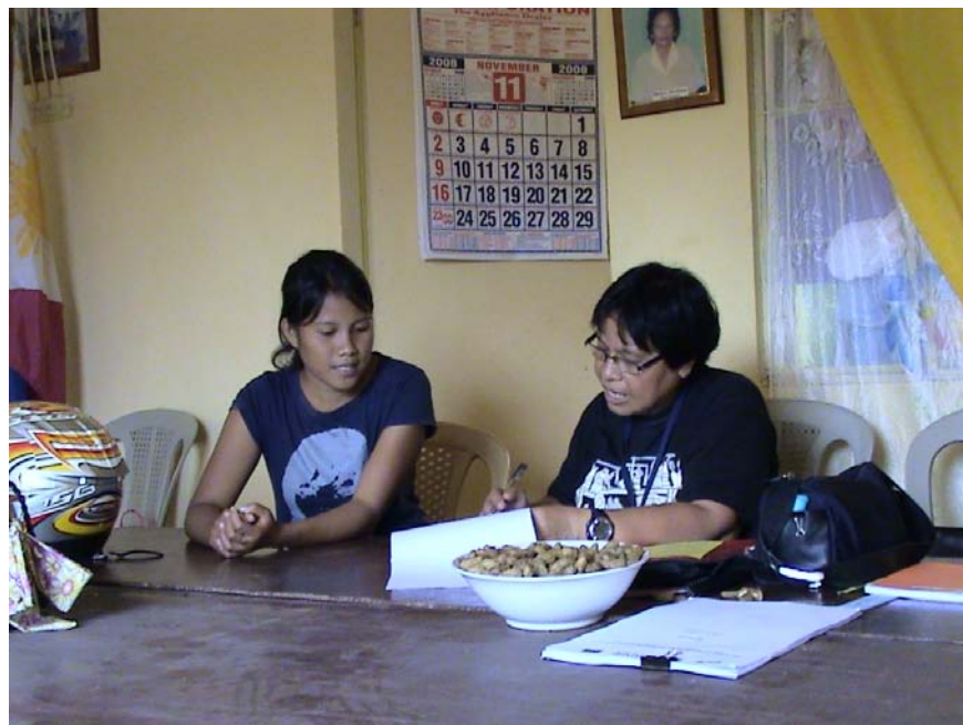
Survey interview in Polangui