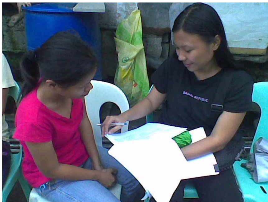
Pre-test of survey questionnaire