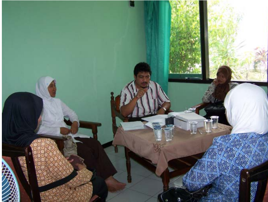
Focus group discussion with village members