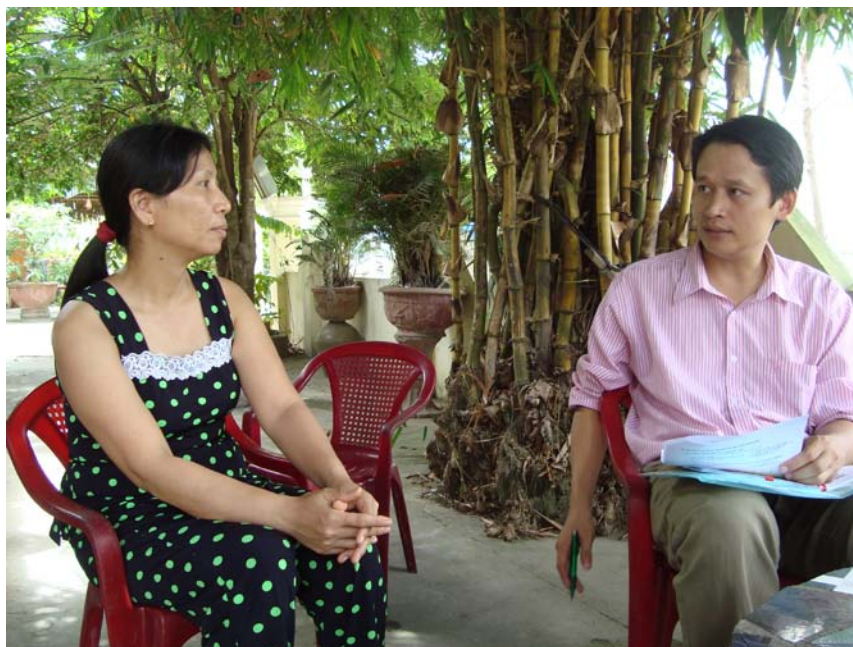
A respondent shares her disaster experience during a pre-test interview