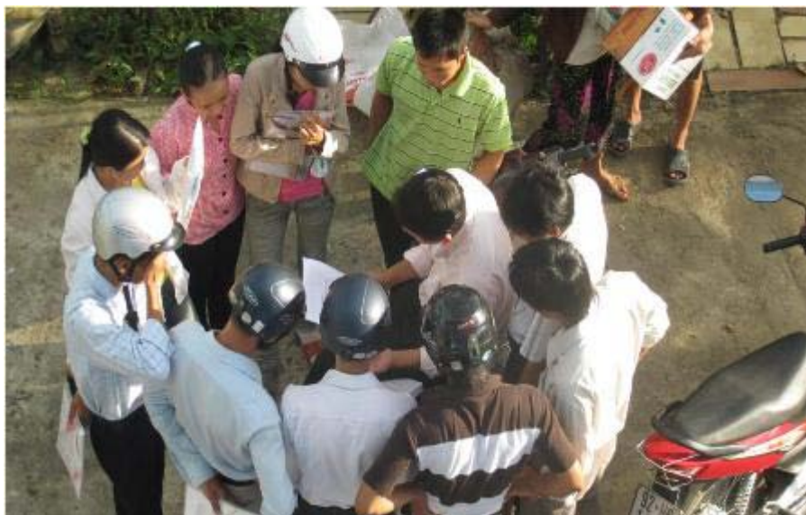
The supervisor instructing enumerators before conducting daily interviews