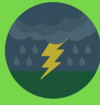
Track of Typhoon "KAREN" [SARIKA]