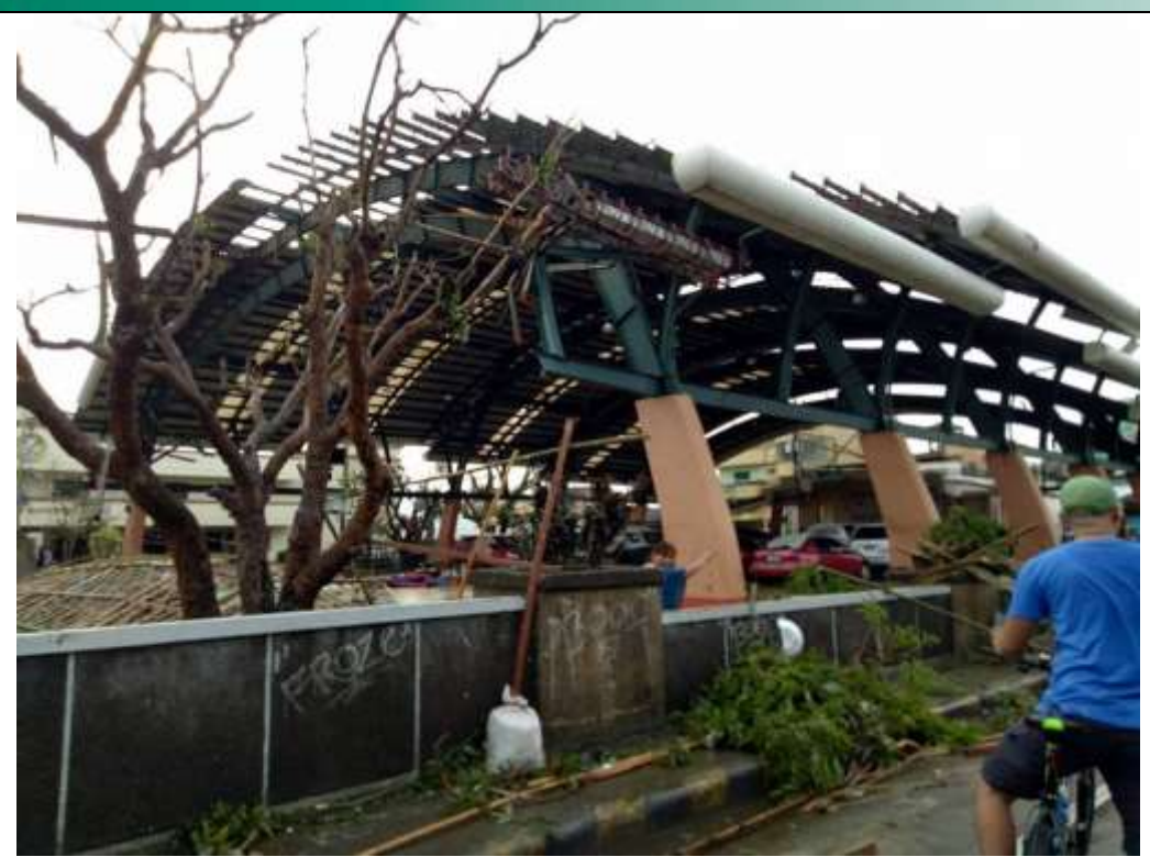
Aftermath in Catanduanes