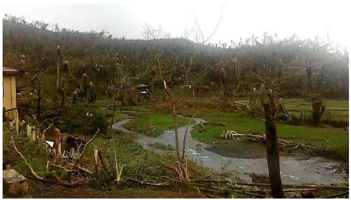
Nina's aftermath in Bato, Catanduanes.