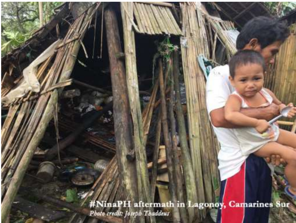
#NinaPH aftermath in Lagonoy, Camarines Sur