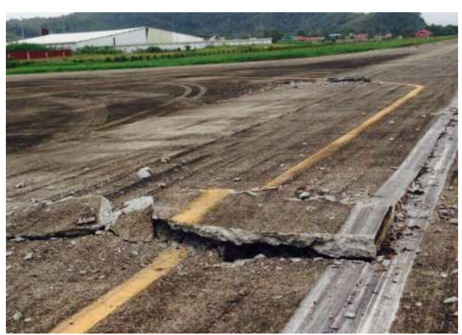
Surigao Airport.