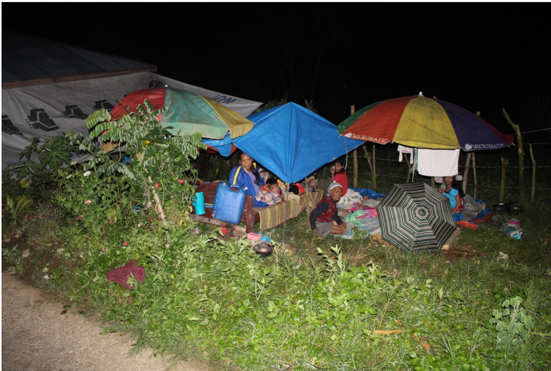
Photo 5. A family camps out on the open space near their collapsed house in Ormoc City.

Widespread power outage is being experienced by the island because the main source of power, the Tongonan Geothermal Power Plant suffered extensive damage. The provinces of Samar, Cebu and Bohol are also suffering blackouts because they also sourced their power from Leyte. The Tagbilaran City DRRMO is conducting water rationing as their water districts have also lost power.