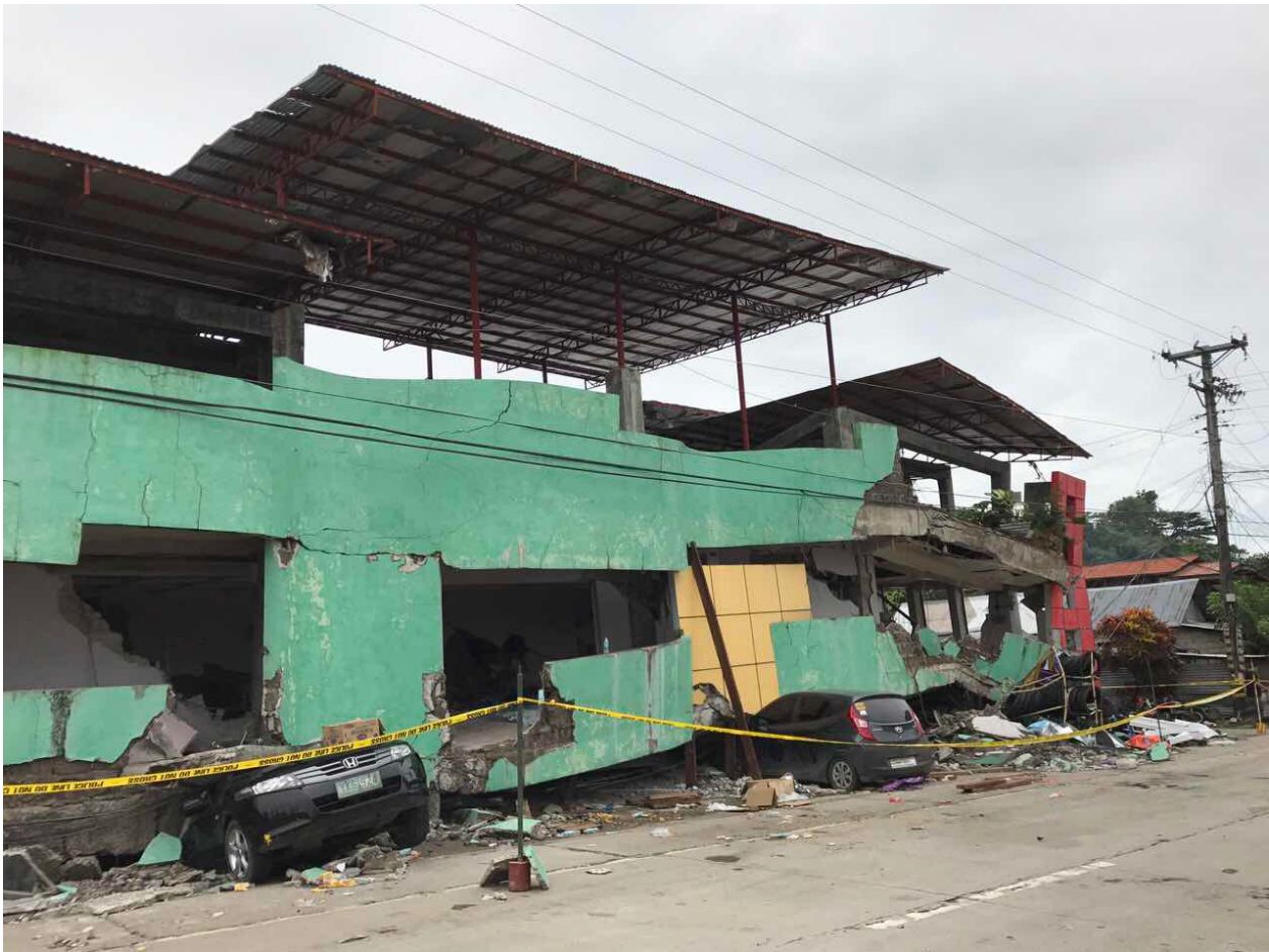
Photo 2. The 3-storey pension house that collapsed in the town of Kananga.