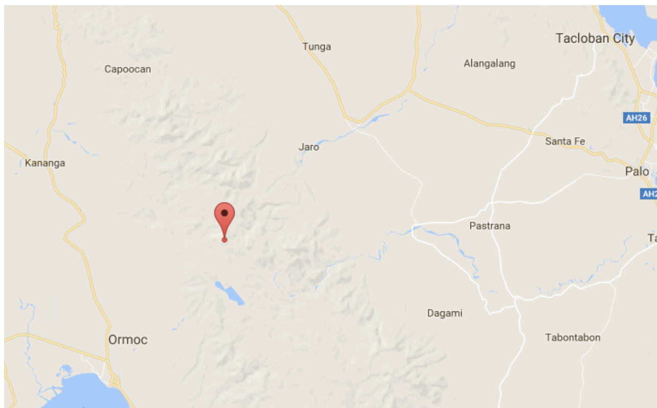
Photo 1. Epicenter of the quake between Jaro and Ormoc, very near Lake Danao and the Amandewin mountain range.