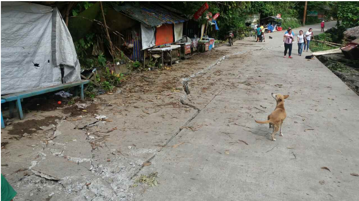
Photo 3. Big cracks are seen on a barangay road in Danay, Ormoc City