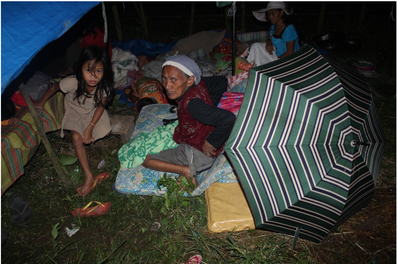
Displaced families in Brgy. Milagro, Ormoc City, Leyte.