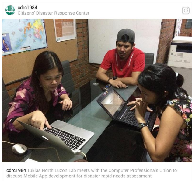
Instagram post on TUKLAS NL lab activity