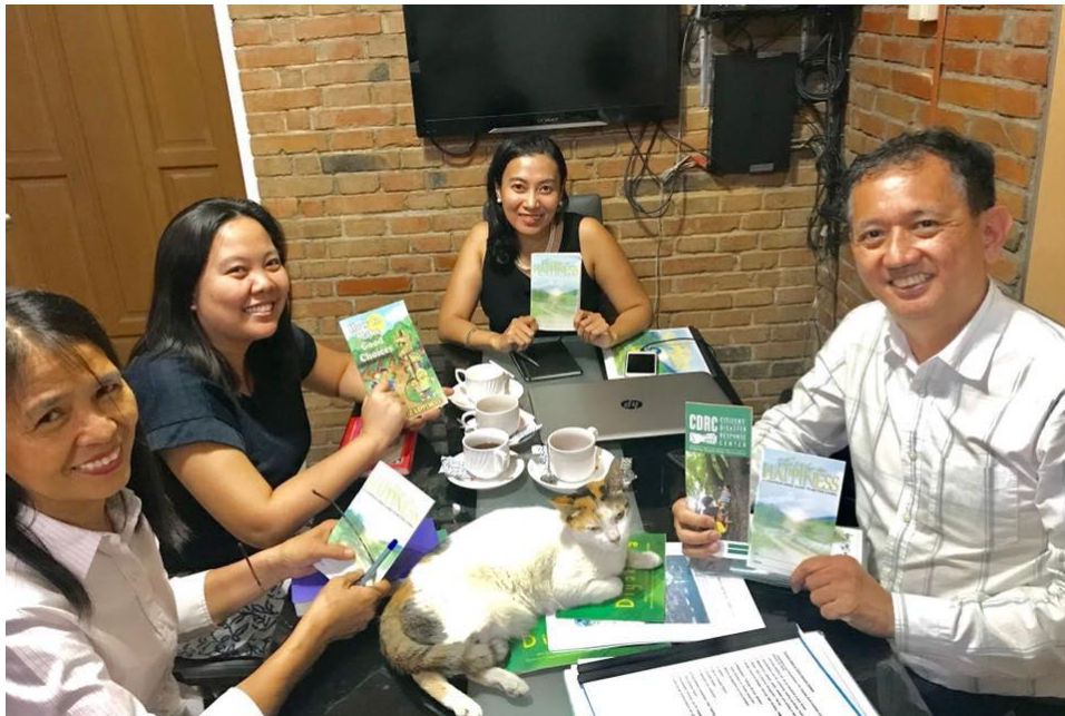
Meeting with The Way to Happiness Philippines

CDRC linked with The Way to Happiness and Healthy Options for potential partnerships. TWHP agreed to connect CDRC with its partners in the United States, while healthy Options committed to mobilize its employees for community outreach programs.