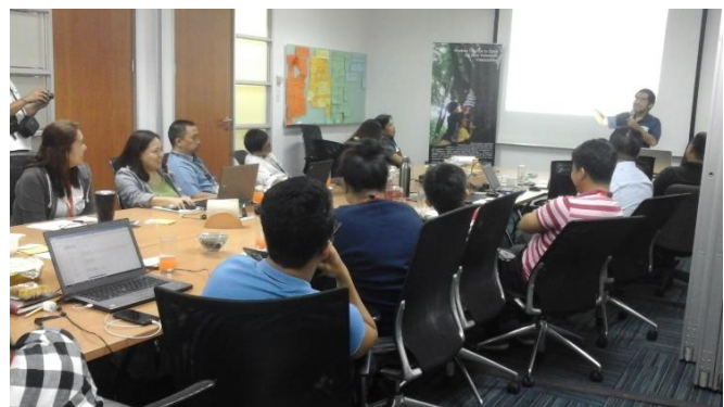
Workplace DRR Training with Oracle, January 25