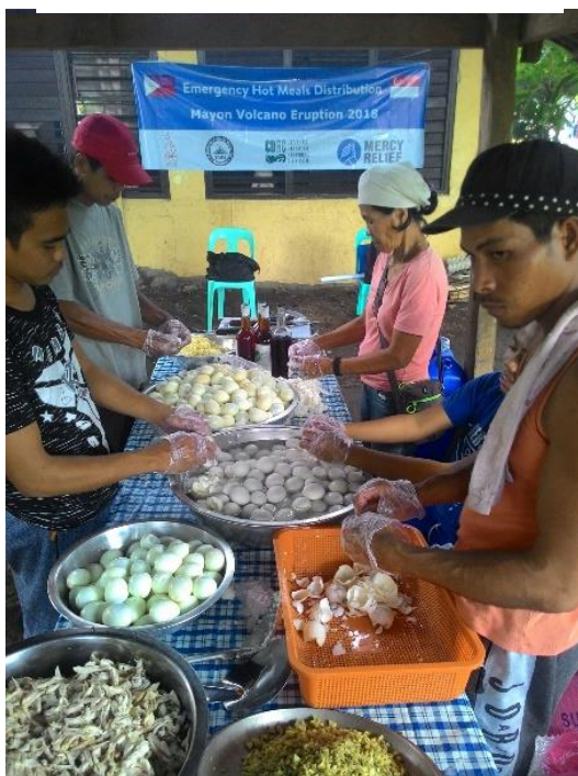
Community kitchen set up inside an evacuation center, Jan. 24-Feb. 2

Hot Meals for Mayon Evacuees: TABI, through the Mercy Relief-supported Emergency Hot Meals Project, served 9,642 people in Albay (Camalig, Daraga, Legazpi City, and Guinobatan) during the Mayon evacuation. Two types of kitchen were set-up: community kitchen and mobile kitchen. Aside from the MR support, TABI was also able to mobilize other groups and individuals into supporting the hot meals project.