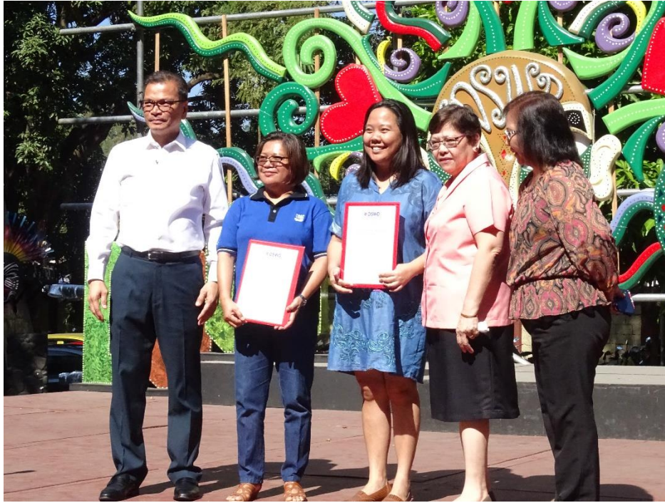
DSWD accreditation ceremony

DSWD Accreditation: CDRC submitted its updated Manual of Operations to DSWD as part of its application for accreditation. On March 19, CDRC finally received its Accreditation Certificate from DSWD.