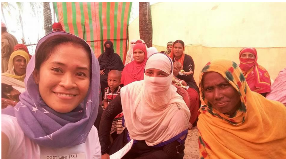
CDRC staff with Rohingya refugees at the Matarbari Community Clinic, March 7

https://www.facebook.com/AsiaPacificAlliance/videos/2037899353117748/UzpfSTIzMtkwNDUwMDYxMT0xMDE2MDAzODkyMDgwNTYxMg/