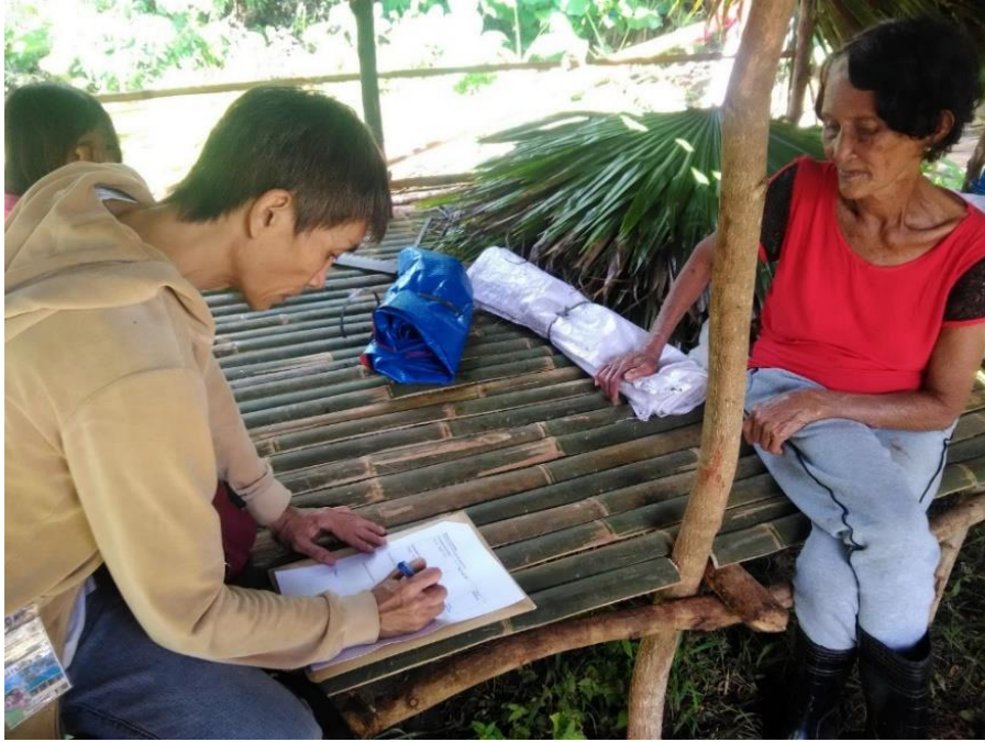
CDRC and TABI conducted a joint DNCA for Mayon Volcano Eruption and immediately produced a Situation Report shared with partners.