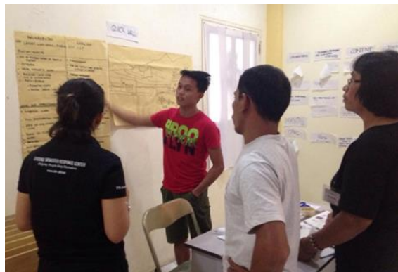
TOT on CCA-DRR, Jan. 24-26, Mindanao