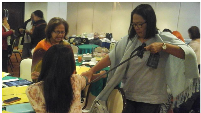
Return demonstration of tourniquet application during the TMAT in Visayas, Jan. 30-Feb. 1