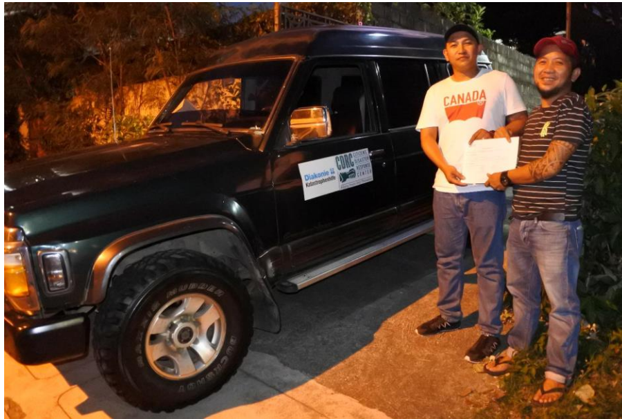
CDRC BOT member hands over patrol car to CVDRC executive director

Handover of vehicles to RCs: Trucks and Patrol cars from the DKH-funded Shelter Project in Leyte were donated to the Regional Centers. This will help increase the emergency response capacities of the RCs during emergencies.