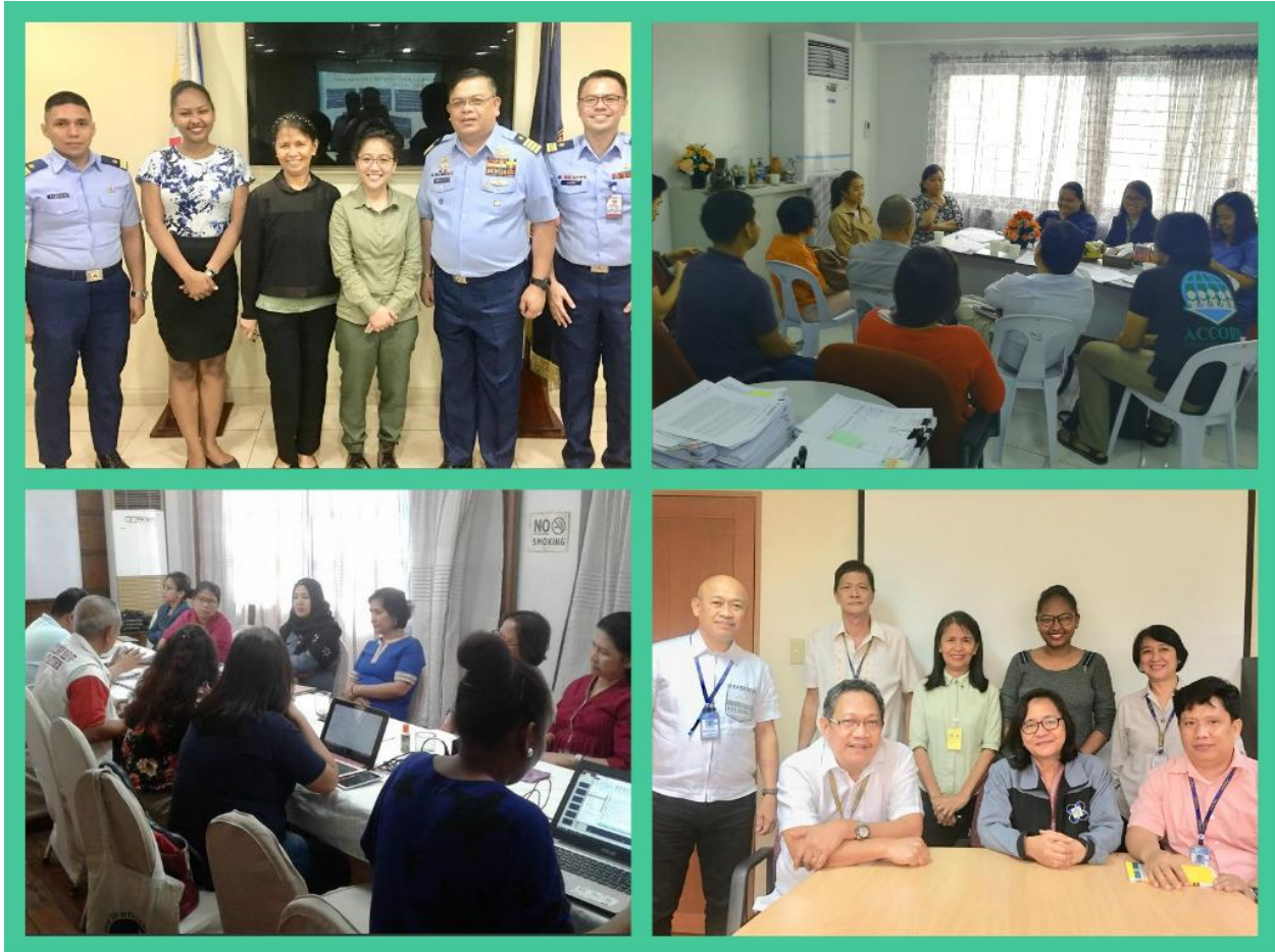
DRRNet consultation meetings with the Philippine Coast Guard, Office of Civil Defense, and weather Bureau PAGASA

DRRNetPhils: As one of the 11 conveners of the Disaster Risk Reduction Network Philippines, CDRC attends the monthly conveners meetings, chairs the Networking and Partnership Committee, and represents the network in the UN-led Humanitarian Country Team as a regular member and the Philippine INGO Network (PINGON) as an observer member.