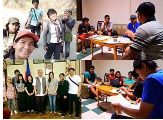
Other TUKLAS activities