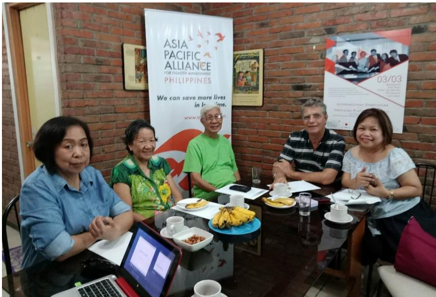
Members of the Board of Trustees, March 5

CDRC BOT Meeting: On March 5, the CDRC Board of Trustees conducted its regular Board Meeting for the year. The ManCom updated the BOT on the ongoing projects of the organization.