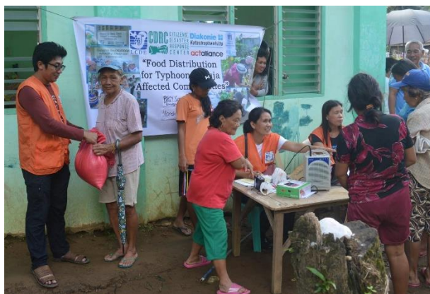
Rice distribution in Borongan, Eastern Samar, March 7-8