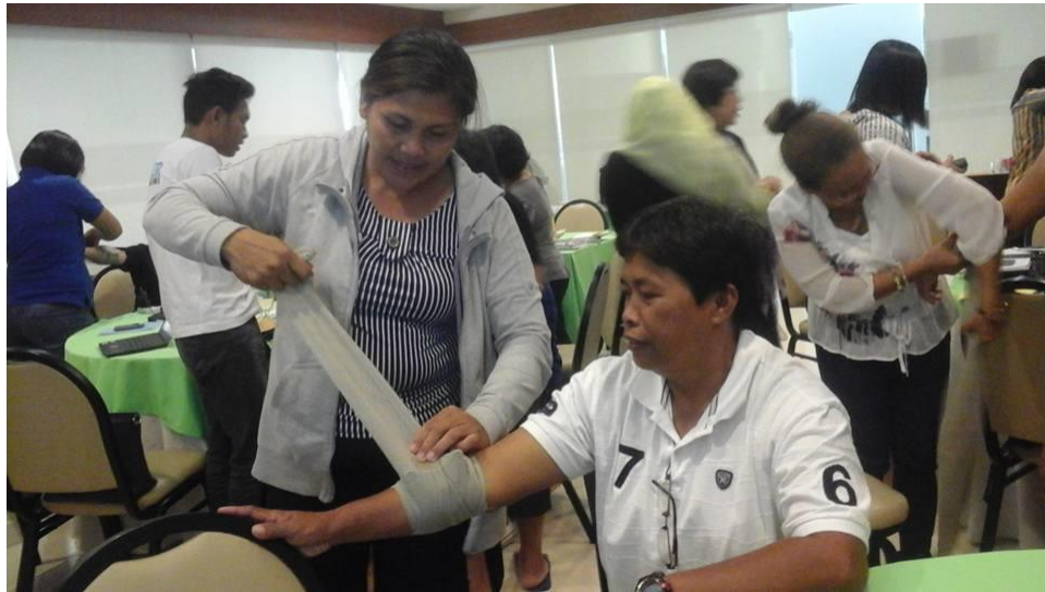
Participants from Mindanao practice wound dressing and bandaging, Feb. 6-8

Alert System Training: CDRC and the RCs participated in a series of trainings on the Alert Platform sponsored by CARE Philippines. The platform is an information management system that facilitates an increased level of emergency preparedness for humanitarian agencies such as CDRC. In addition, CDRC also took this opportunity to provide a short orientation to the RCs on the revised DNCA Form. CARE staff also provided a training on Basic First Aid during these workshops.