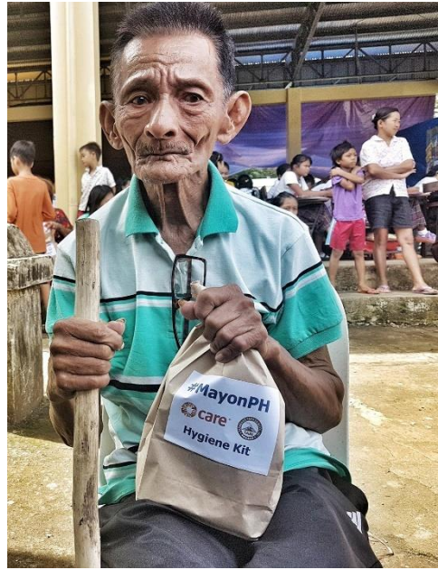
An elderly receives a hygiene kit from CARE Phils, Jan. 31