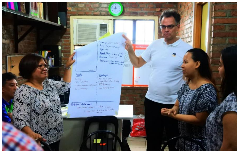
Presentation of workshop results during SAP training, March 20

SAP Disaster Relief Platform: Last March 20, SAP, the software company, introduced to CDRC a supply chain platform for humanitarian actors. CDRC has agreed to pilot test this platform and see if this can be useful during emergency response.