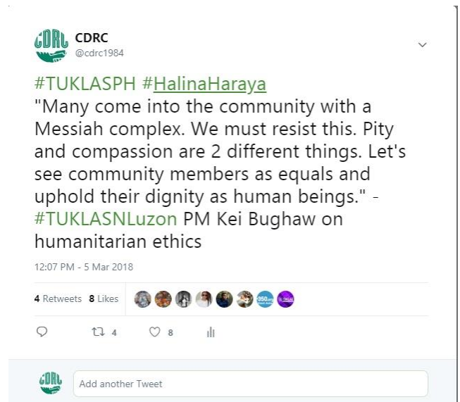
Twitter post on activity highlights