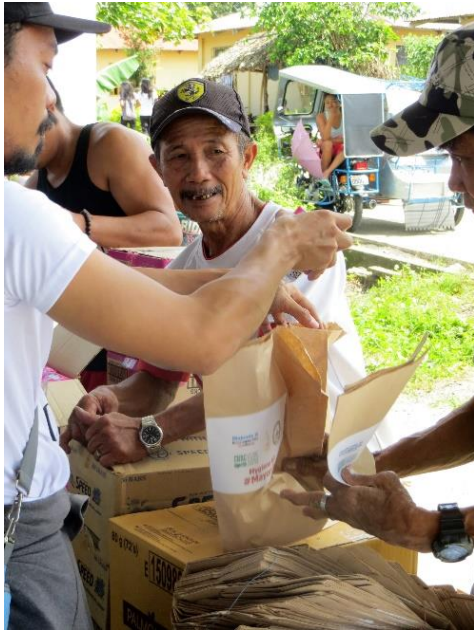
Hygiene kit distribution from DKH, Feb. 7

Emergency Relief Assistance Fund (ERAF) for Mayon Response: Distribution of hygiene kits to 436 families from Brgy. Bañadero who sought refuge at a relocation site in Brgy. Anislag, Daraga, Albay in Bicol and 258 families from Barangay Upper Cabangan in partnership with DKH and CARE Philippines.