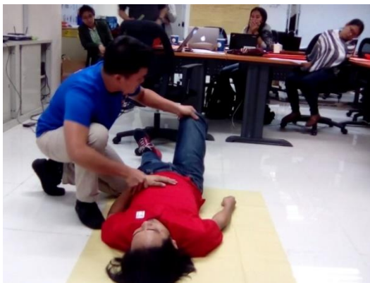
Tactical Medicine Awareness Training (TMAT) during the Alert System Rollout in Luzon, Jan. 16-18