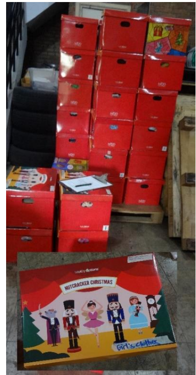
Right: Pre-sorted clothes from Healthy Options

CDRC received goods for prepositioning from companies and private individuals. Donations range from pre-loved clothes, shoes and kitchen utensils. Some of these donations were already given to survivors of fire in Metro Manila.