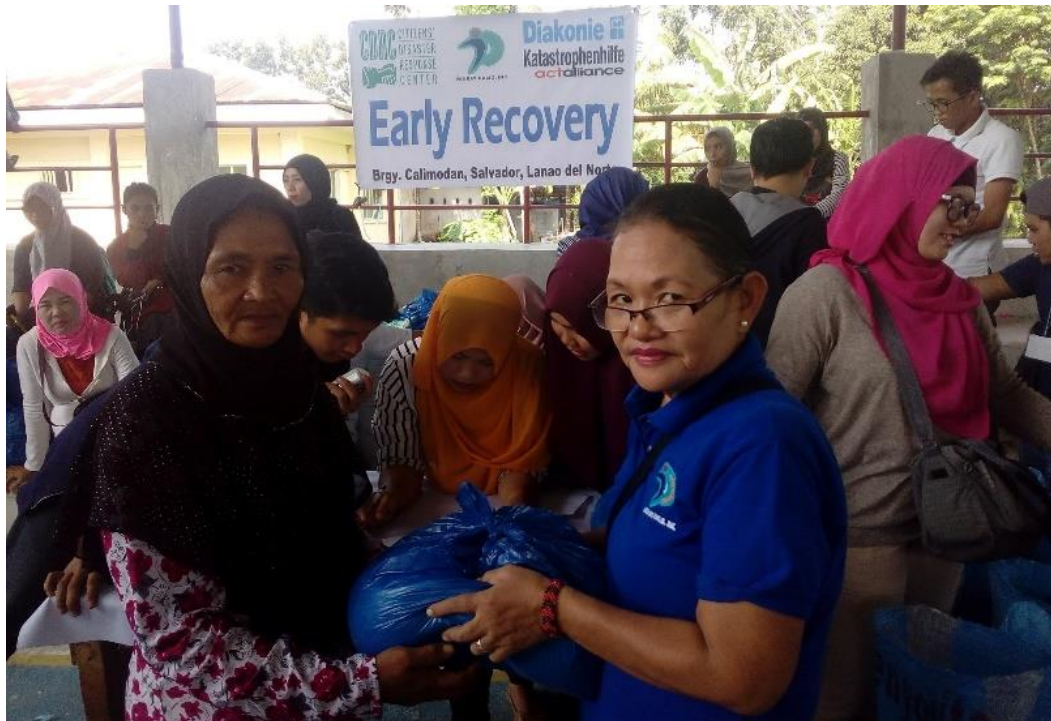
Rice distribution for typhoon Vinta survivors in Lanao del Norte, March 14-15

This is part of the early recovery assistance from Diakonie Katastrophenhilfe (DKH) to Typhoon Urduja and Typhoon Vinta-hit communities in Visayas and Mindanao. Implementing partners are Leyte Center for Development, Inc. (LCDE), Panday Bulig, Kadait and Mindanao Interfaith Services Foundation, Inc. (MISFI). A total of 685 Urduja-affected families and 900 Vinta-hit families will receive cash assistance that will enable them to purchase food, seeds, kitchen utensils, farm tools and shelter repair materials to expedite their recovery.