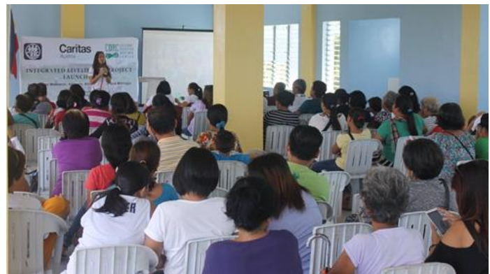
Official launch in Medellin, Cebu on March 16

Livelihood projects supported by Caritas: Caritas Austria supports a two-year Livelihood Project in Cebu and Negros Occidental, which started on Dec. 1, 2017 and will end on Nov. 30, 2019. Implementing partners are Center for People's Resources and