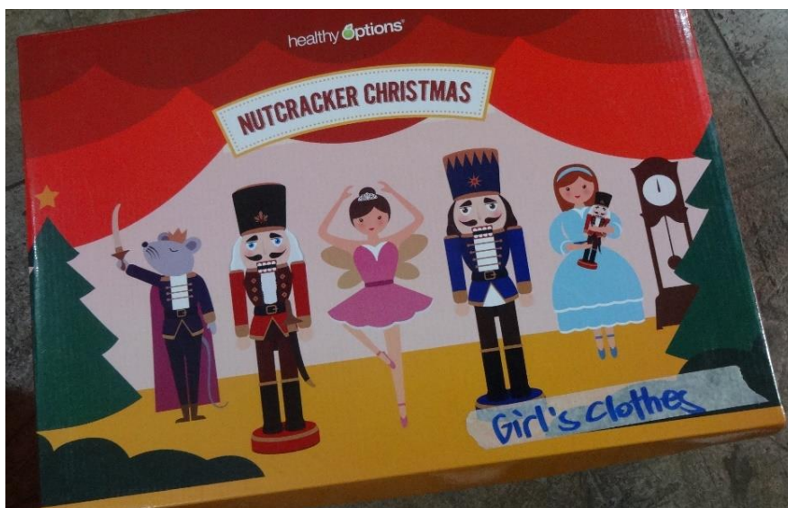
Donated [sorted] pre-loved clothes as an initial result of engagement with Healthy Options