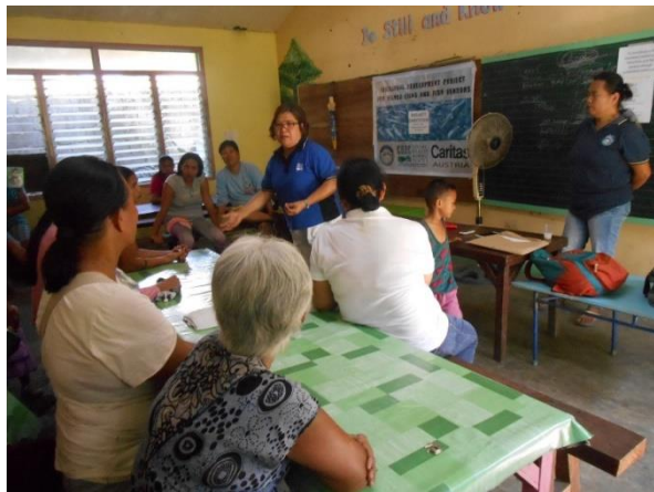
Caritas Project Orientation in Negros Occidental, March 14

Mayon Response from A-PAD PH Metro Naga: The Metro Naga group of A-PAD PH supported the community kitchen of TABI for Mayon evacuees. A total of 6,000 evacuees were served.