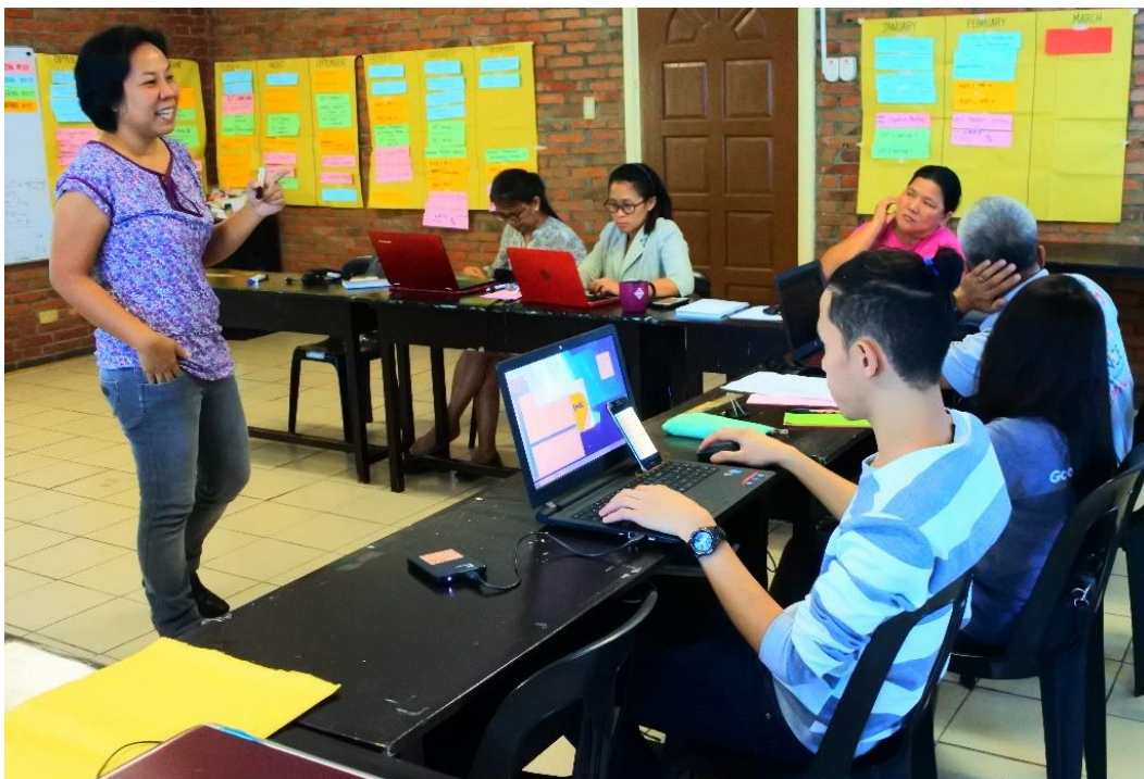
A-PAD staff during the National Project Planning Workshop, March 19-21

A-PAD PH Year 3: The Japan Ministry of Foreign Affairs has finally approved the Year 3 funding for A-PAD Philippines. The project officially started last March 6.