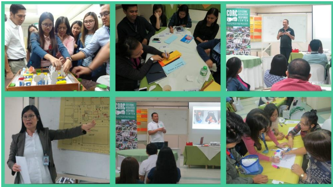
Workplace DRR trainings conducted for PNB Gen Insurers staff from Feb. 13 to March 1