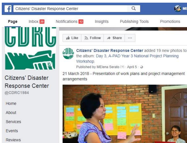
FB Page post on CDRC activities

Regular updates on CDRC/N activities, photos, news, articles, situation reports and information on DRR and CCA (9) were posted on CDRC website, FB Page, Twitter and Instagram accounts.