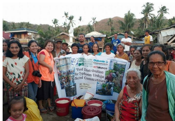
Rice distribution in Can-avid, Eastern Samar, March 9-10