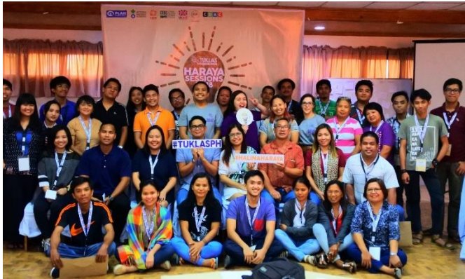
TUKLAS Haraya facilitators and participants, March 5-8