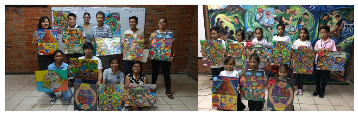
ABKD winning entries and winners

The yearly national ABKD contest for children was also successfully launched. Winners were awarded last October 7, during CDRC's anniversary week. The artworks were used in the 2017 Disaster Preparedness Calendar. Close to 400 children from all over the country joined the contest. The Department of Education also formally endorsed the activity to all public elementary schools.