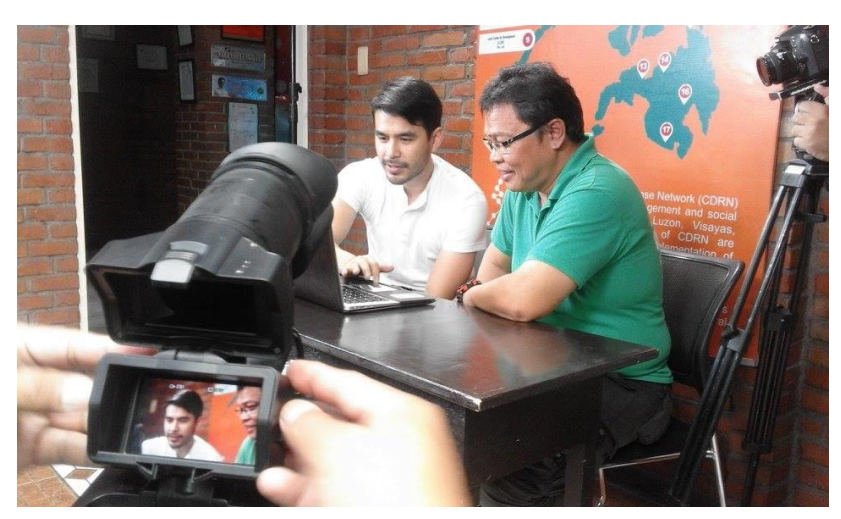
Interview with Red Alert