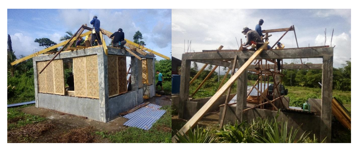
Shelter Project in Jaro, Leyte with DKH

Aside from projects mentioned above, the RCs also went on to implement early recovery and rehabilitation projects on their own. CVDRC, ICRED and CorDisRDS directly partnered with CARE Philippines for a shelter and livelihood project in Northern Luzon for Typhoon Lawin. TABI also partnered with CARE for a Typhoon Nina shelter project. All of these projects with CARE used a cash transfer modality.