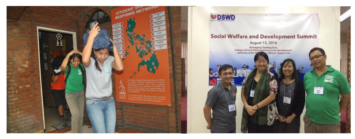
CDRC participates in Metro-wide Shake Drill in preparation for the Big One