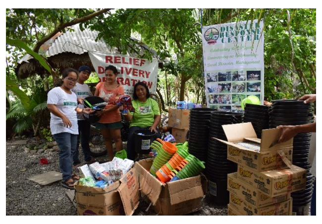
Relief operation for flood-affected families in Metro Manila