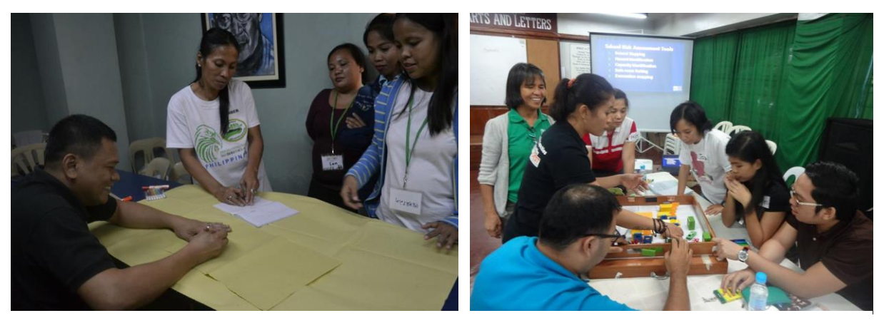
CBDM Training for the Urban Poor Sector