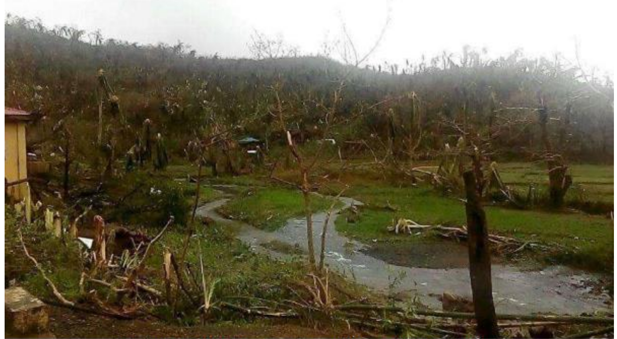
Nina's aftermath in Bato, Catanduanes.