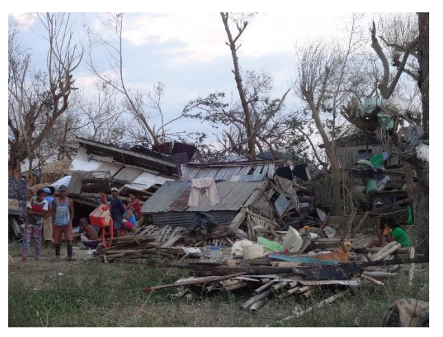
Typhoon Lawin aftermath in Cagayan Valley