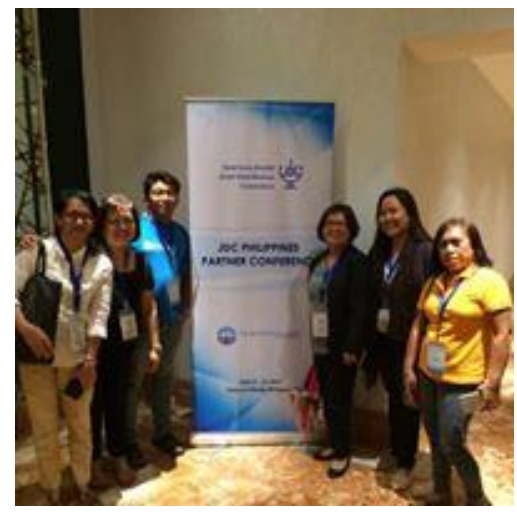
JDC Partners' Conference