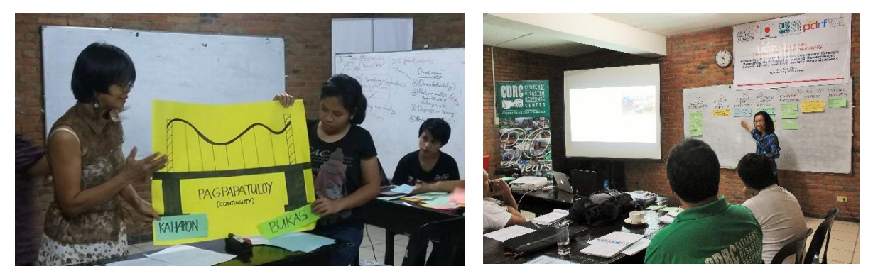
Psychosocial Training of Trainers