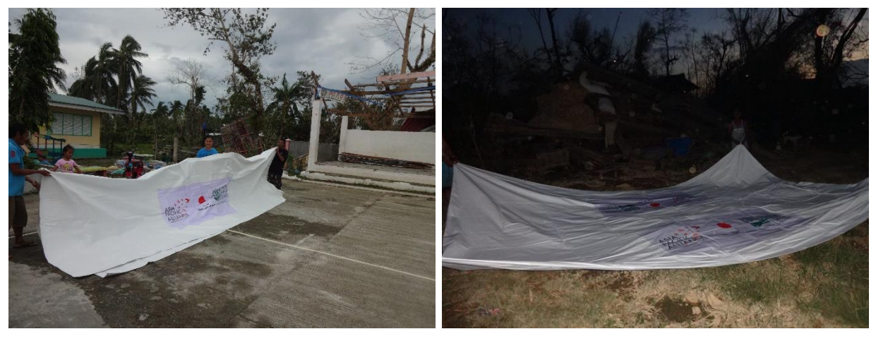
Tarpaulins for public spaces such as barangay halls, schools, etc.

In addition, the A-PAD prepositioned tarpaulins for evacuation centers, schools and other public spaces were also distributed in Nueva Ecija, Zambales, Aurora and Cagayan after Typhoon Lawin. These were used as emergency and temporary roofing.