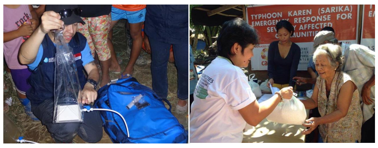
CDRC distributed water filter from Mercy Relief Relief distribution in Nueva Ecija for Typhoon in Amulung, Cagayan after Typhoon Lawin Karen with CARE and A-PAD

*Emergency Relief Assistance Fund or ERAF was used for the Typhoon Lawin response with DKH; see details in Table 9