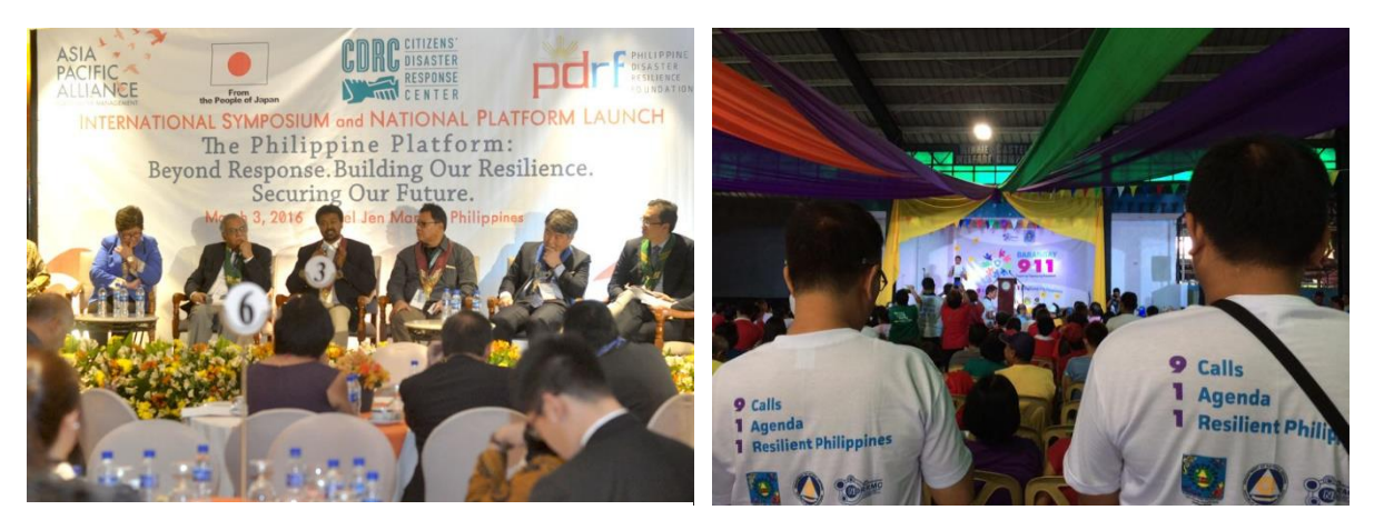
A-PAD PH Int'l Symposium and Launch