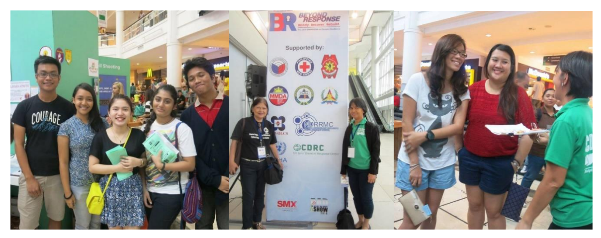
Volunteers at the CDRC booth during the RADSHOW and iVolunteer events

CDRC was able to disburse funds to the RCs for small emergencies such as localized fire, drought, flood, etc. through the stand-by Emergency Relief Assistance Fund (ERAF) from the Core Program supported by DKH.