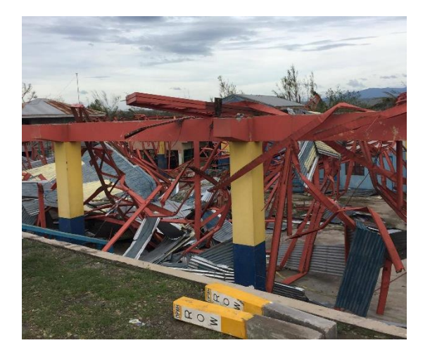
Collapsed structure due to typhoon Karen