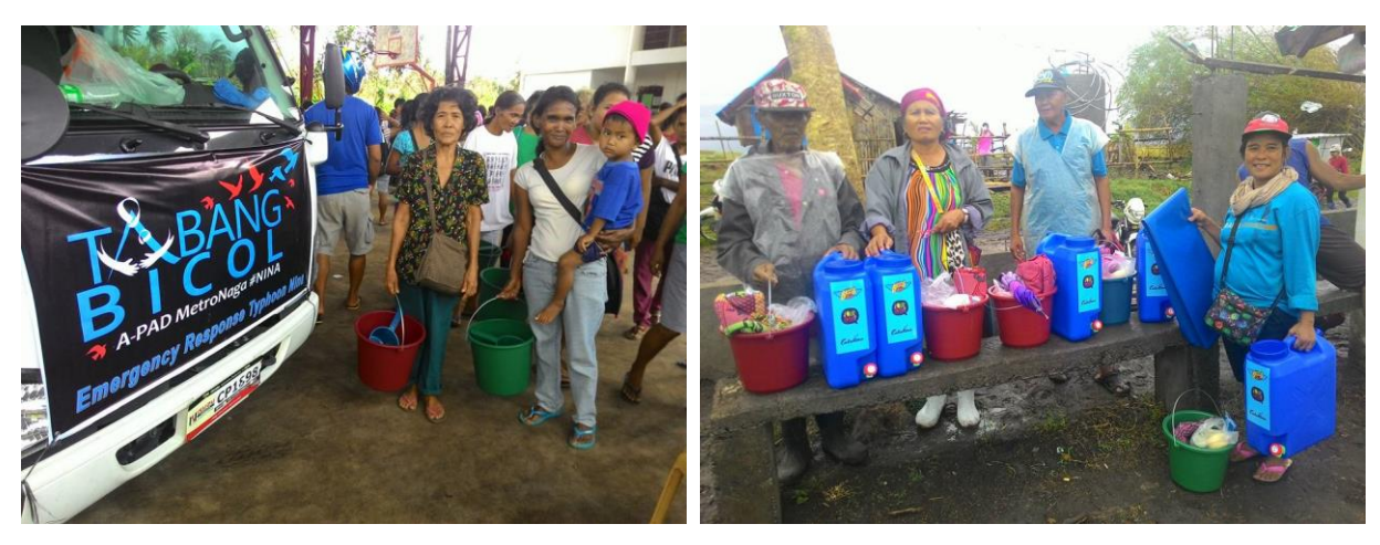
A-PAD Metro Naga group pooled resources for Typhoon Nina response

In addition, the A-PAD prepositioned tarpaulins for evacuation centers, schools and other public spaces were also distributed in Nueva Ecija, Zambales, Aurora and Cagayan after Typhoon Lawin. These were used as emergency and temporary roofing.