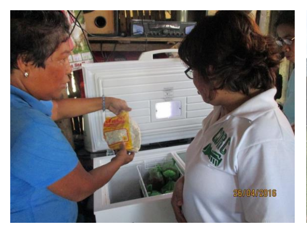
Frozen products in the Caritas Project

For early recovery and rehabilitation, Typhoon Yolanda projects continued in 2016. These are the Shelter and Livelihood projects with DKH in Leyte and Samar, and the Caritas Austria Livelihood project in Cebu and Negros.