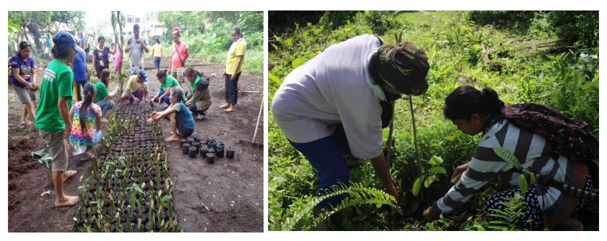
Mitigation activities of DPCs in Bicol and Leyte for the Encap Project