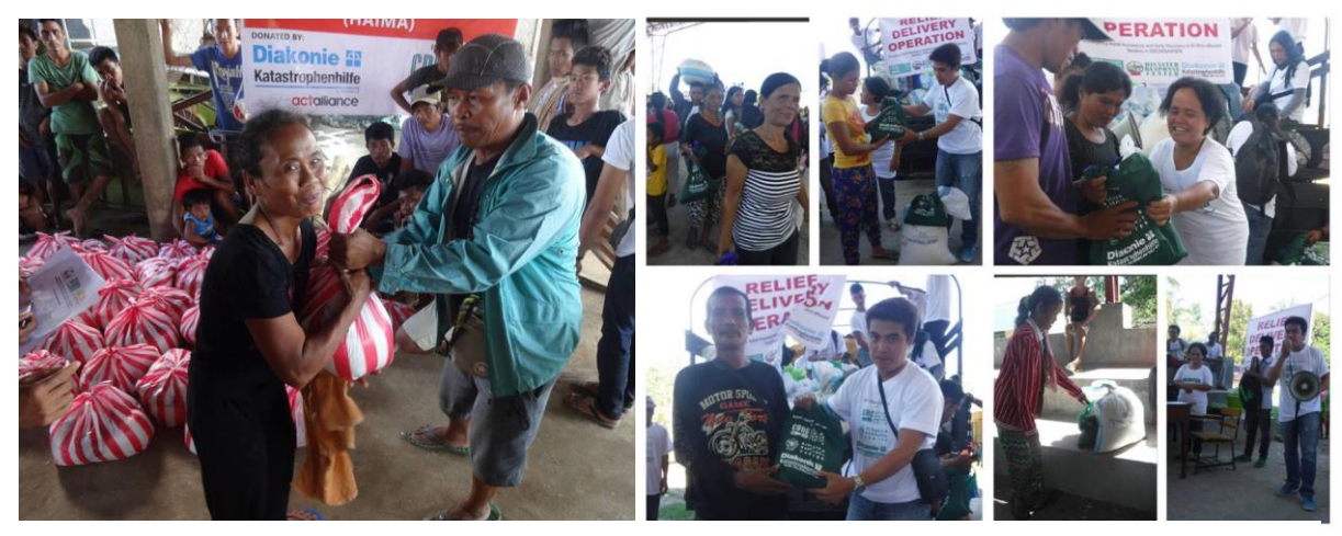
Relief operations for Typhoon Lawin in Cagayan; and the drought in Mindanao

In most of these major emergency responses, CDRC and partners strived to adhere to the SPHERE standards, especially in fulfilling the minimum amount of calories required per family.