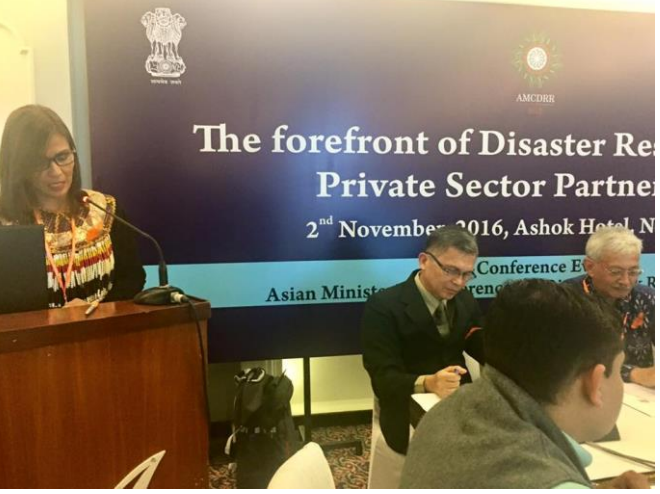
Moderating a side event at the AMCDRR